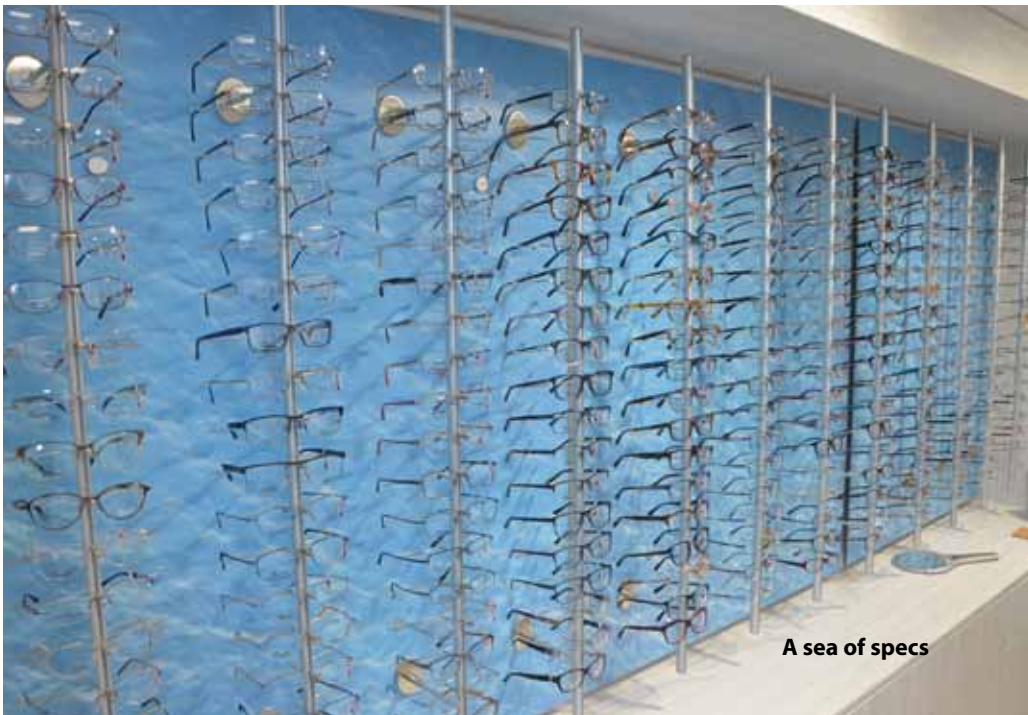
A sea of specs